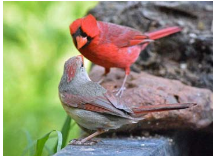
Northern Cardinal pair

Second, the CARES Act allows taxpayers of any age and any income level to get a break in 2020 for their charitable donations, whether or not they itemize. Taxpayers who take the standard