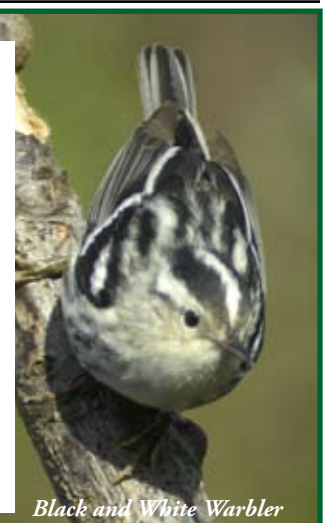
Black and White Warbler

Thomas Wosachlo for accounting assistance.