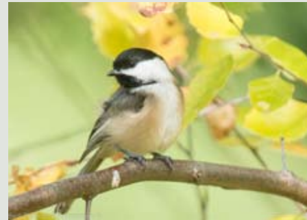
Chickadee in Birch

Fall has descended, and the great natural habitats that have sustained our native bird population and the insects that thrive here in northern Michigan are entering a long period of hibernation. Oblivious of the virus that has changed human behavior worldwide this year and likely into the future, birds and other forms of wildlife have gone about