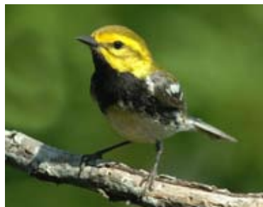
Black-throated Green Warbler

Yellow Warbler – Breeds in riparian edges of streams, lakes and swamps across northern two-thirds of U. S. up through most of Canada and Alaska. Winters in western Mexico down through Central America