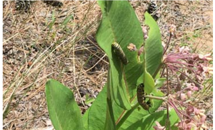
Milkweed with caterpillars.