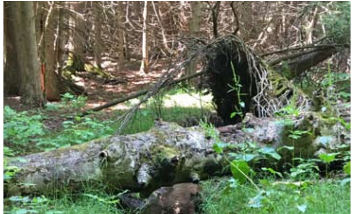
Headwaters of wetland.