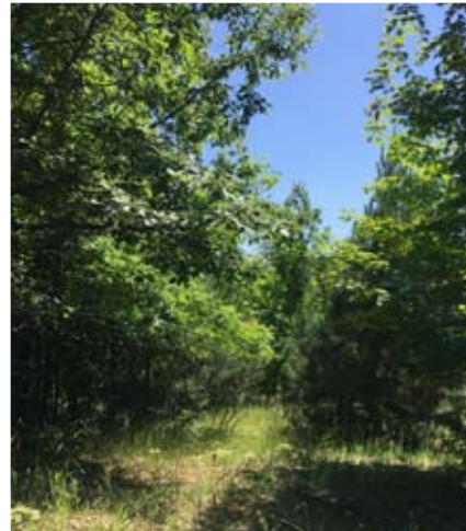
Daddy Oak on the left